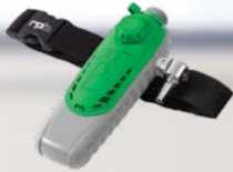
Supplied Air Page 34