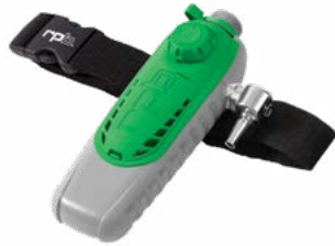
→ C40™ Climate Control Device (SAR)