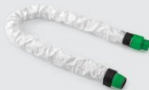
Tychem® Hose Cover Breathing tube not included.