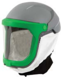
→ Tychem® 2000 Face Seal