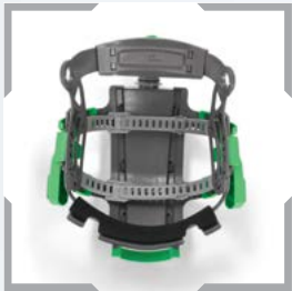
Shown without cape for marketing purposes only >>

Customizable head suspension system includes an adjustable ratchet at the back and over-the-head straps to allow for a secure, individualized fit.