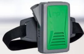
Powered Air Page 26

Join RPB as we embark on a new frontier in respiratory protection, enabling you to perform at your best, while ensuring you and those around you are protected for life's best moments.