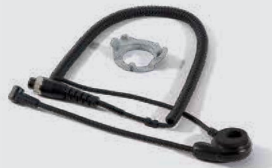
Comms-Link™ In-helmet communication system