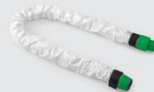
Tychem® Hose Cover Breathing tube not included.