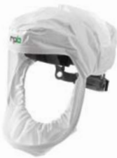
→ Tychem® 2000 Face Seal