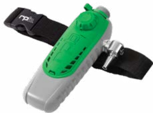
→ C40™ Climate Control Device (SAR)