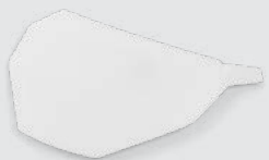
Clear-Vision Cassette Lens 7 layers.