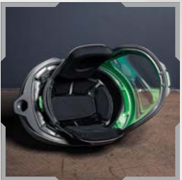
Shown without cape for marketing purposes only >>

Padded interior with an adjustable ratchet system that ensures a customized fit that supports movement and increases comfort. The optional Comfort-Link™ system provides extra comfort and stability providing optimum weight distribution.