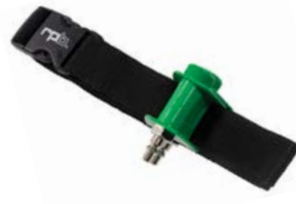
→ Constant Flow Valve (SAR)