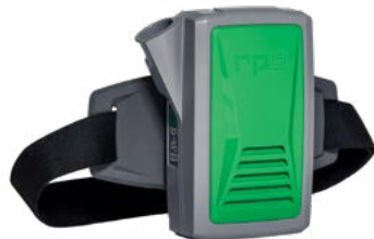
→ PX5® (PAPR) HEPA, OV/AG/HE, Multi-Gas/HE, A2P, ABE1P & ABEK1P gas cartridges/filters available.