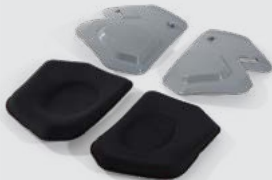
Comfort-Link™ Side padding system