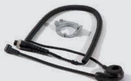
Comms-Link™ In-helmet communication system