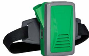
→ HX5™ (PAPR) HEPA cartridges/filters available.