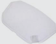
Tear-off Lens Available in packs of 50.