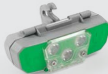
Vision-Link™ 650 lumen helmet lighting system