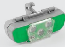
Vision-Link™ 650 lumen helmet lighting system