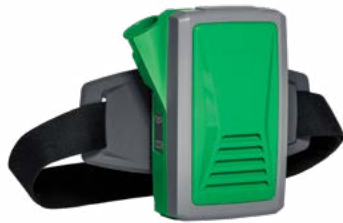
→ HX5™ (PAPR) HEPA cartridges/filters available.