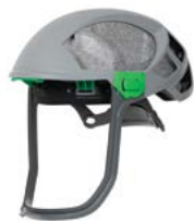
→ T-Link Bump Cap