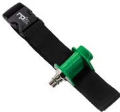
→ Constant Flow Valve (SAR)