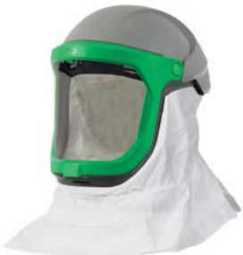
→ Tychem® 4000 Shoulder Cape