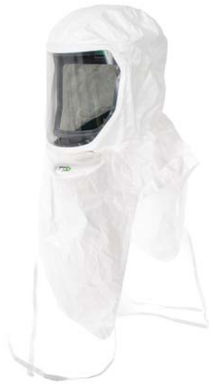
→ Tychem® 4000 Extra Length with Sealed Seams, 0.40 Lens Includes tuck-in double bib.