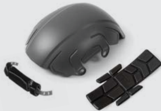
Bump Cap Available with comfort and brow pad, and front strap.