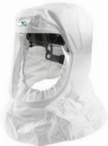
→ Tychem® 2000 Shoulder Length Hood with Face Seal