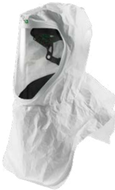
→ Tychem® 2000 Full Hood with Neck Seal Includes tuck-in double bib.