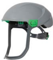
→ T-Link Hard Hat