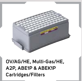
OV/AG/HE, Multi-Gas/HE, A2P, ABE1P & ABEK1P Cartridges/Filters

HE cartridge/filter - removes up to 99.97% of particulates down to 0.12 microns. Gas cartridge/filter - protects against organic vapor exposure. Replace the pre-filter daily to extend the life of the main cartridge/filter.