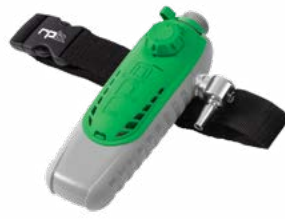
→ C40™ Climate Control Device (SAR)