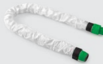
Tychem® Hose Cover Breathing tube not included.