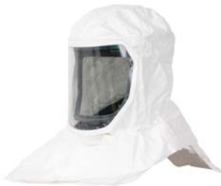
→ Tychem® 4000 with Sealed Seams Includes tuck-in double bib.