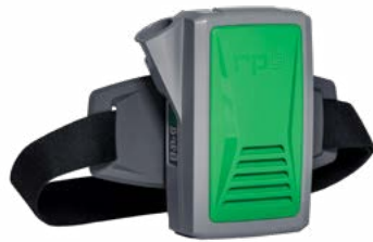
→ PX5® (PAPR) HEPA, OV/AG/HE, Multi-Gas/HE, A2P, ABE1P & ABEK1P gas cartridges/filters available.