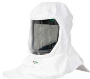
→ Tychem® 2000 Includes tuck-in double bib.