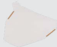
Peel-off Lens Available in packs of 25.