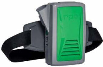
→ PX5® (PAPR) HEPA, OV/AG/HE, Multi-Gas/HE, A2P, ABE1P & ABEK1P gas cartridges/filters available.