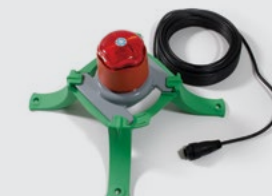
Auxiliary Strobe and Alarm Tower with 50' Cable