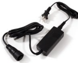
→ Power Adapter Pack For US, EU, UK, or AU.