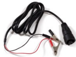
→ 12V Cable with Battery Clips