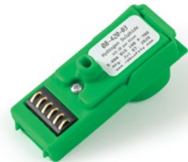
→ Hydrogen Sulfide 10ppm