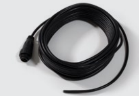
Auxiliary Cable 50' with Bare End