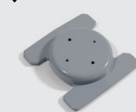
Aluminum Wall Bracket